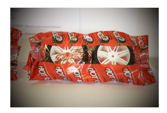
35 rear (74mm)