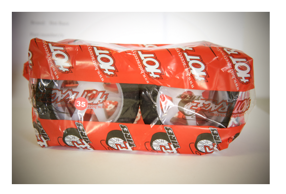
Hot Race tyres are imported by 'Direct-Hobbies'. http://direct-hobbies.com